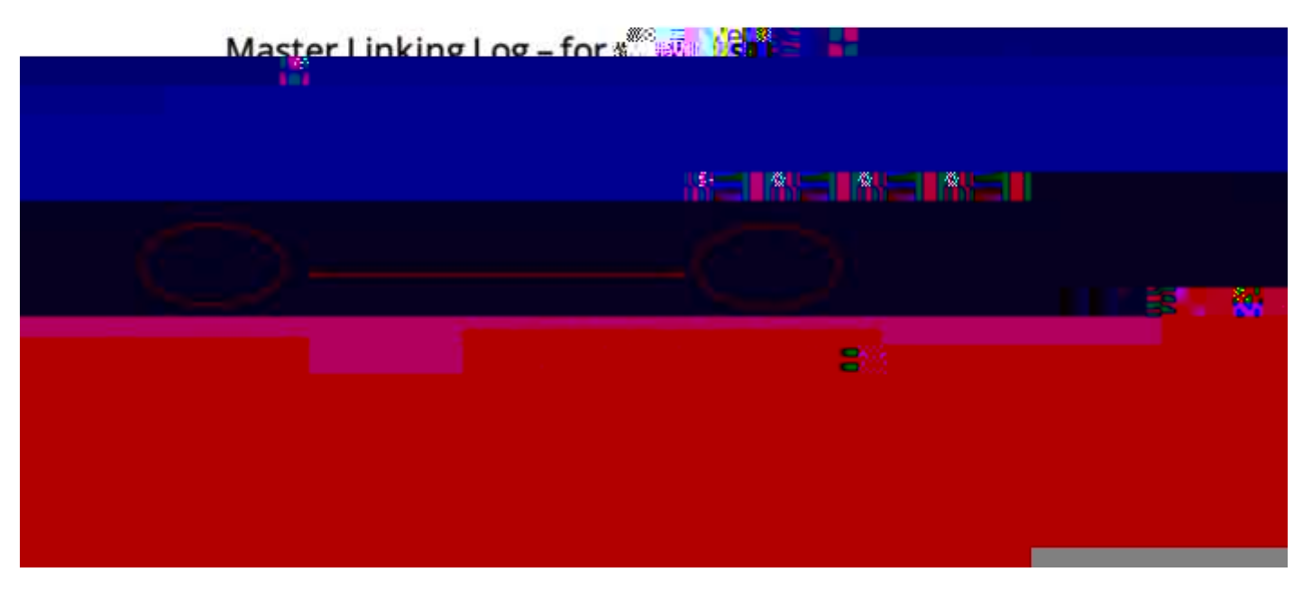
Example B. In this scenario, no MRN is collected, thus access to contact information is not possible through medical records. In this case, a unique identifier (full name) is stored in the master linking log along with phone number, for contact purposes. Phone numbers can be considered identifiable information, and justification must be provided to the REB.