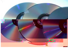
Old CD or DVD