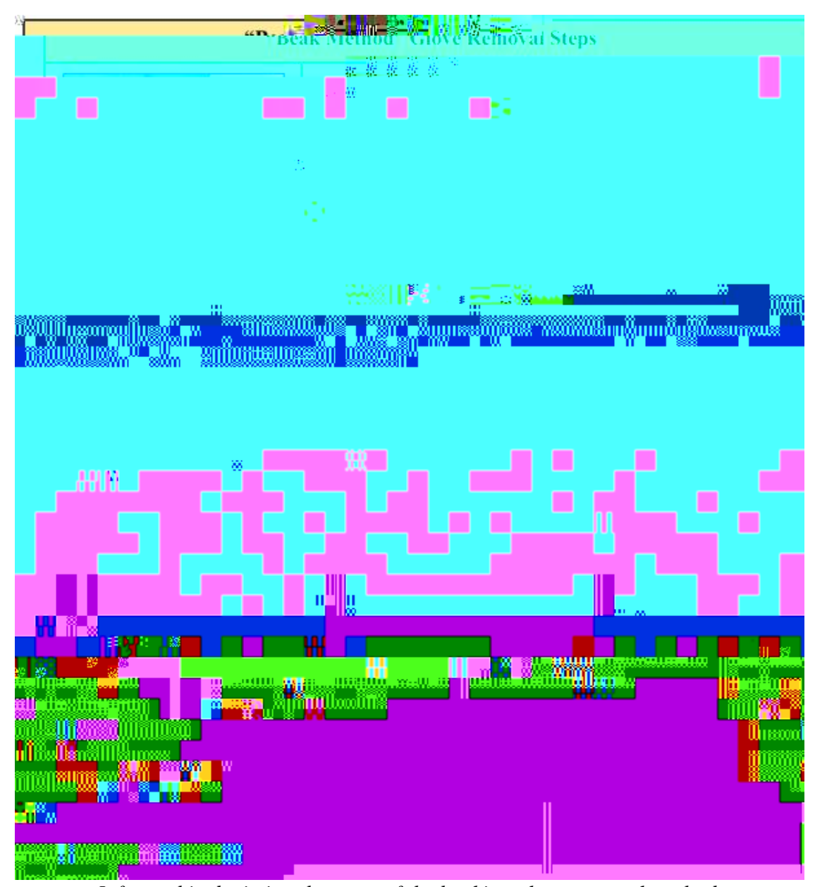
Infographic depicting the steps of the beaking glove removal method.