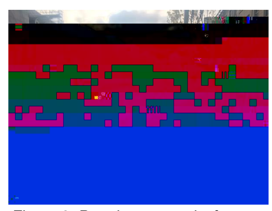
Figure 3: Prominent security features at the US Embassy

However, it is of some importance to note that there were some positive elements of the integration into the urban environment such as: